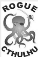
Rogue Cthulhu Gaming Guest