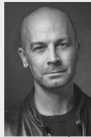
Scott Sigler Author Guest

www.clevelandconcoction.org Follow us on Facebook and Twitter @CLE_ConCoction